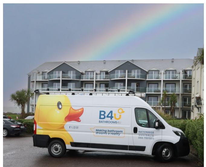
B4U at Inchydoney Island Lodge & Spa, Clonakilty