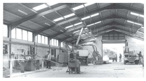
ICS Contract Furnishers workshop, circa 1974