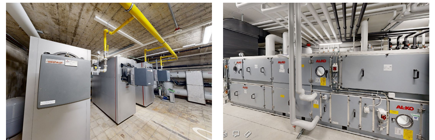
A well-maintained example of a back-of-house plant room.